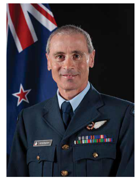
Air Commodore Kevin McEvoy Air Component Commander HQ Joint Forces New Zealand