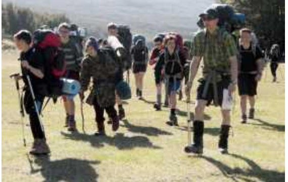
I am pleased to report that all returned safely!